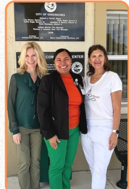
Roses for Poses Mindfulness at Greenacres Senior Center