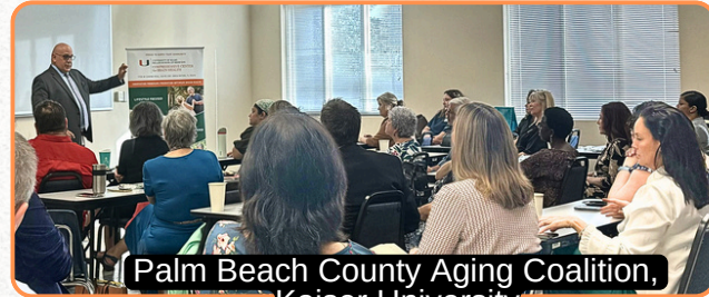
Palm Beach County Aging Coalition, Kaiser University