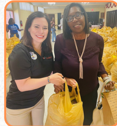
Finer Body, Mind, Spirit at Harris Chapel