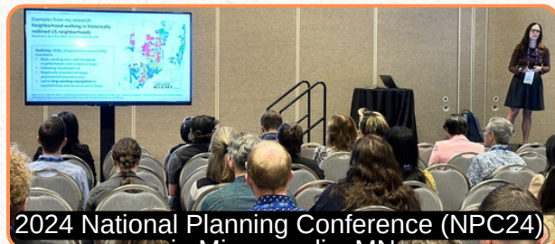
2024 National Planning Conference (NPC24) in Minneapolis, MN