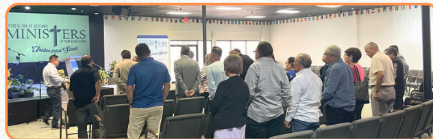
Association of Hispanic Ministers, West Palm Beach