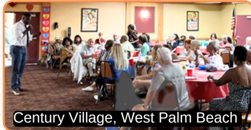
Century Village, West Palm Beach