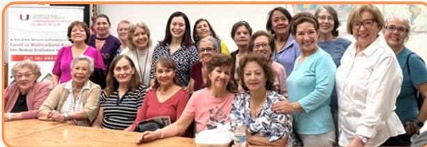
SW Focal Point Senior Center, Pembroke Pines