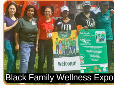
Black Family Wellness Expo